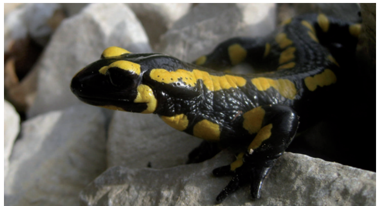
Figure 1 – Fire Salamander ( Salamandra salamandra )

Fire Salamanders are food generalists, they mostly feed on slugs and arachnids. Fire Salamanders are nocturnal animals, their diurnal activity depends on air temperature, air humidity and air flow. They usually leave their