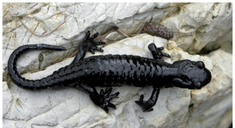
Figure 2 – Alpine Salamander ( Salamandra atra )

lairs at more than 85% relative air humidity. They hibernate underground, for example in crevices, caves or mine tunnels, in places with constant temperatures and air humidity (Grossenbacher & Thiesmeier 2003).